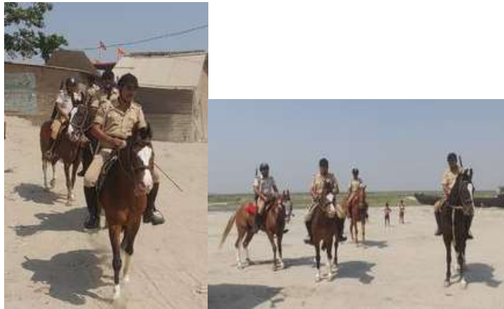
Security personnel Patrolling on horses in Katihar, Bihar

The polling was held smoothly and peacefully in all States/UTs. The Commission led by CEC Shri Rajiv Kumar along with ECs Shri Gyanesh Kumar and Shri Sukhbir Singh Sandhu constantly monitored the polling process since morning. Stringent security measures were implemented to maintain law and order, creating a conducive environment for voters to cast their vote without fear or intimidation. Webcasting was done in over 1 lakh Polling Stations.