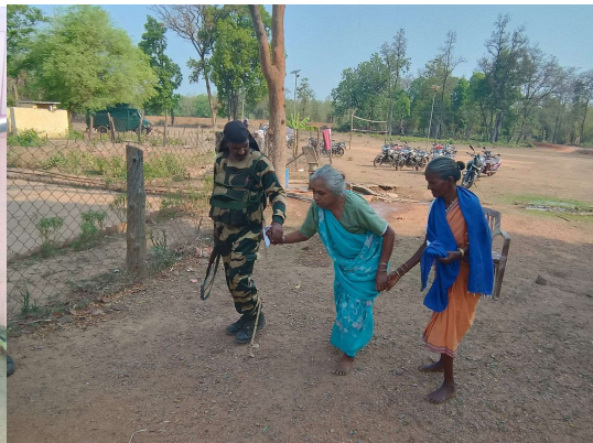
Newly set up PS in Bastar and Kanker

The Commission had made special efforts to facilitate voting amongst the Particularly Vulnerable Tribal Group (PVTGs), elderly, young and first-time voters, women, and transgenders.