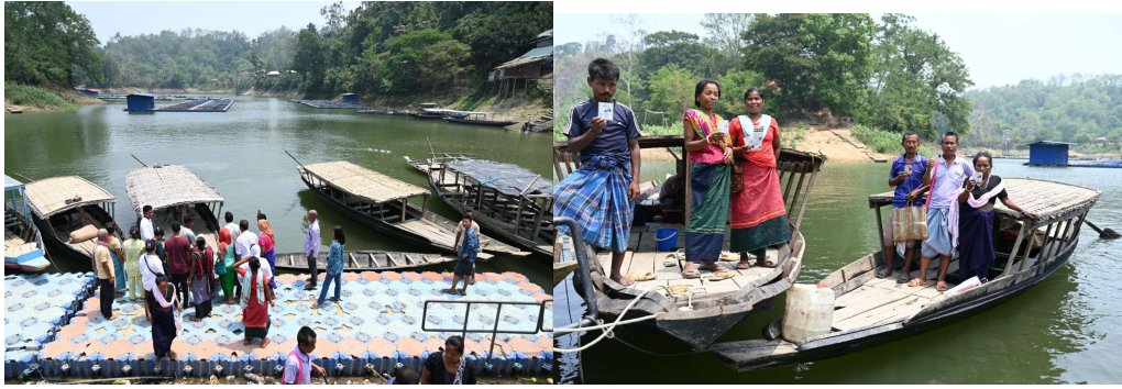
Voters from Raima Valley, a remote area of Dhalai Assembly segment in Tripura came to polling stations through boats to cast their vote.