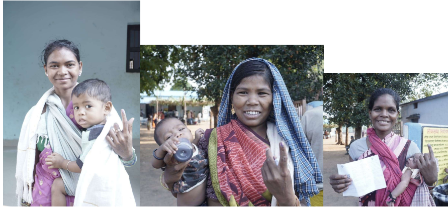
Voters of the Kamar PVTG from Kulhadi Ghat village in Mahasamund PC