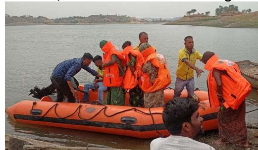
Voters were assisted to cross the Kadana Backwater voters to reach the Badgama polling station Badgama Chikhli Dungarpur Rajasthan.