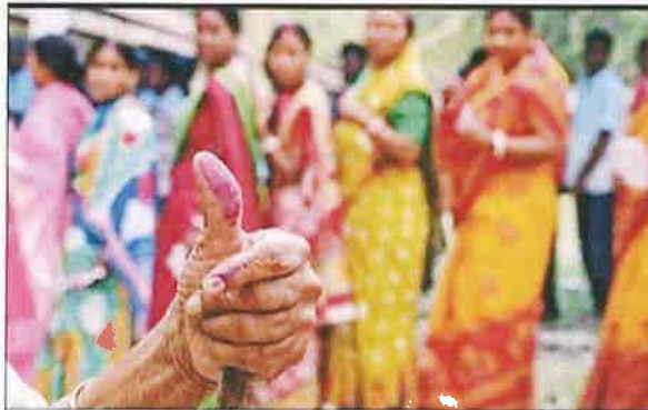
A voter flaunts her inked finger at a polling station in Kalamati village in West Bengal's Cooch Behar on Friday

"Election Commission has worked extremely hard over the past couple of years to make a smooth and peaceful Lok Sabha election a reality. The first phase turnout is very encouraging and should entice voters to come out in even big-