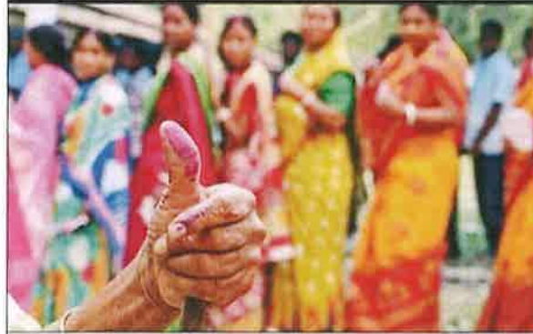
A voter flaunts her inked finger at a polling station in Kalamati village in West Bengal's Cooch Behar on Friday

"Election Commission has worked extremely hard over the past couple of years to make a smooth and peaceful Lok Sabha election a reality. The first phase turnout is very encouraging and should entice voters to come out in even high-